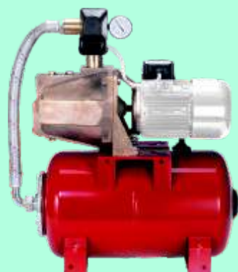
GA-BJ 3 / 20L

Pressure booster sets, widely used in the nautical sector where they grant a suitable and constant water pressure for all on-board appliances such as: showers, washbasins, toilets, etc.