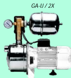
GA-IJ / 2X