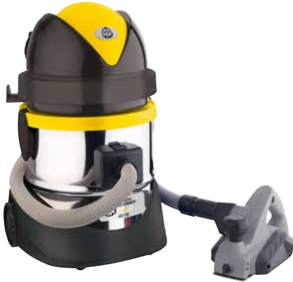
Mod. WD 30E