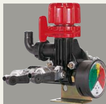
GR 40* AR 303, AR 403, AR 503