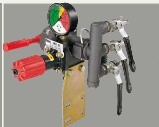
VDR 50* BHA-BHP 130, BHS 90-105-110-120 AR 503, AR 30, AR 50