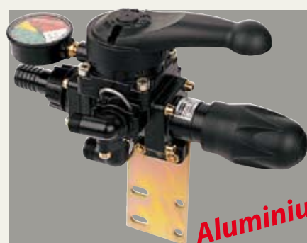
BY MATIC 50* BHA-BHP 130-150-170-200