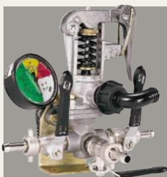
GI 40* AR 30, AR 50, AR 303, AR 403, AR 503