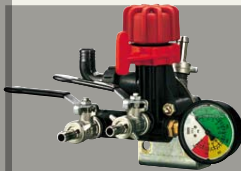
GR 20 S* AR DUE, AR 202, AR 252, AR 303, AR 403