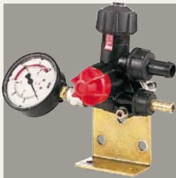
VR 20 S* AR DUE, AR 202