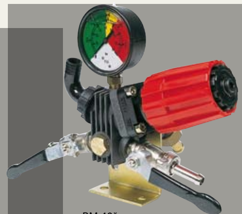
RM 40* AR 503, AR 30, AR 50