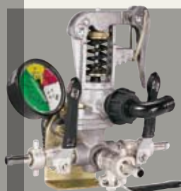
GS 20 S AR 70bp