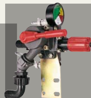
VDR 20 S AR 70bp÷AR135bp