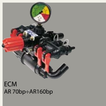
ECM AR 70bp÷AR160bp