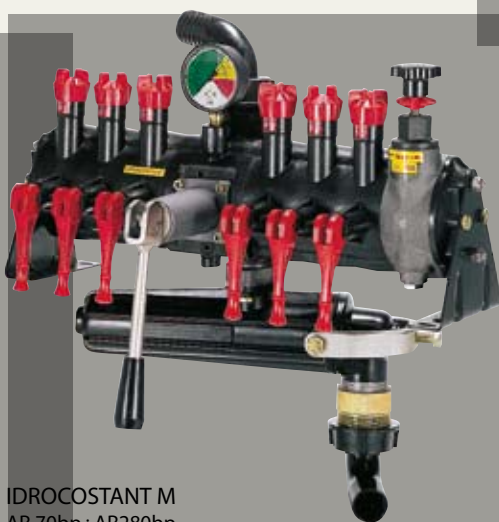
IDROCOSTANT M AR 70bp÷AR280bp