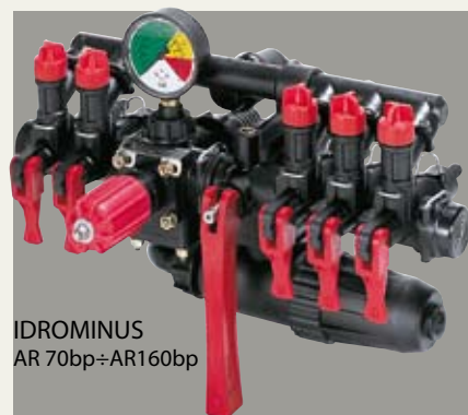
IDROMINUS AR 70bp÷AR160bp