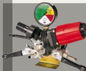
RM 20 S AR 70bp÷AR115bp